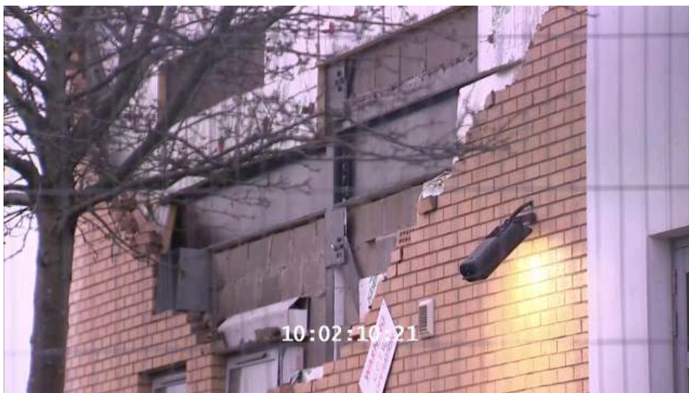
Fig.2. Oxbgangs Primary School, Édimbourg, une des écoles faisant partie de la première vague de PPP signés en 2001 avec le consortium Edinburgh Schools Partnership .

SOURCE : HM TREASURY, PFI : Meeting the investment challenge , July 2003, p. 37.