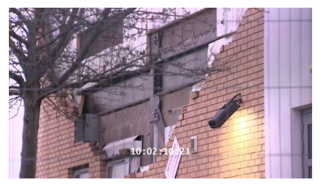
Fig.2. Oxgangs Primary School, Édimbourg, une des écoles faisant partie de la première vague de PPP signés en 2001 avec le consortium Edinburgh Schools Partnership .